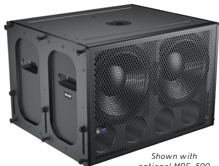
Shown with optional MRF-500 rigging frame